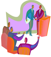
Speakers and Guests June 2017

Newsletter Date: 2017 OCTOBER Branch Web Site Address: bcgreach.com